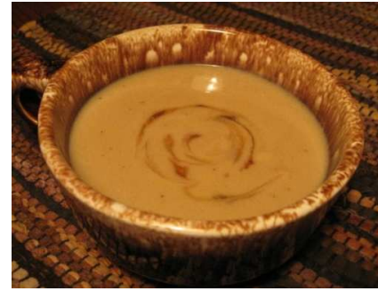
Maple Parsnip Soup - garnished with a drizzle of maple syrup

Maple Parsnip Soup really is good. In fact, very good! Parsnips give it its unique 'sweet' root vegetable taste. Maple syrup also adds sweetness while mustard provides some balance with its tangy flavour. You could proudly serve this soup as a "take the chill off winter" dinner starter, or for lunch or a light supper along with a sandwich or salad.